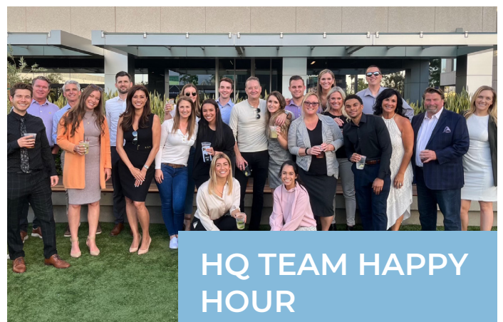
HQ TEAM HAPPY HOUR

We'd love to discuss how we support Managing Directors, create an inclusive culture, and encourage a fun work + life balance.